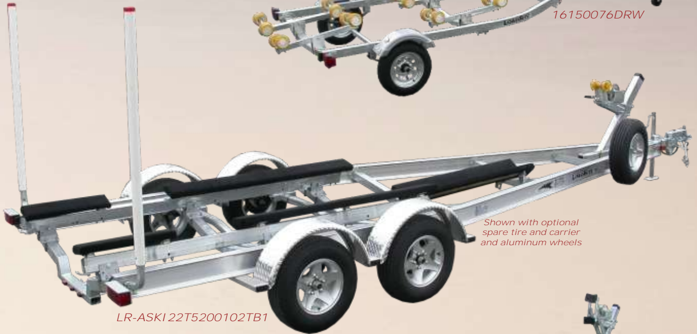
Shown with optional spare tire and carrier and aluminum wheels