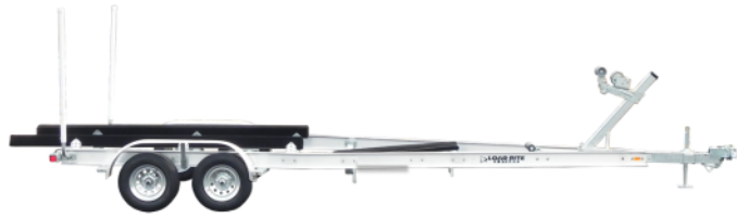
Image of Model #5S-AC26T6700102LTB1. Options and features may differ.