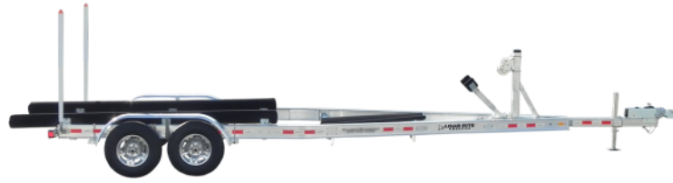
Image of Model #5S-AC28T10000102TB2. Options and features may differ.