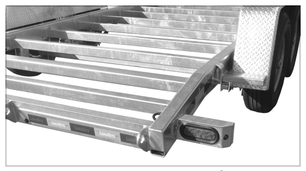
Typical galvanized trailer frame.